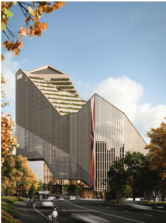
Caption: An artist’s impression of the proposed 21-storey high-rise building above Auckland's Aotea Station.