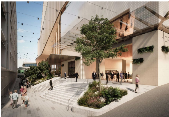
Caption: The proposed development will include high-density housing, shops as well as commercial spaces in the heart of Auckland city.