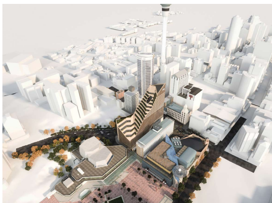
Caption: The site on the Mayoral Drive/Wellesly St, which was once a car park.